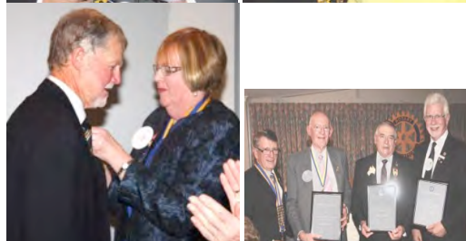
and three retiring Directors