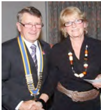
Batemans Bay Public School Breakfast Club