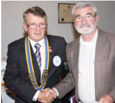
St Cecilia Music Scholarships