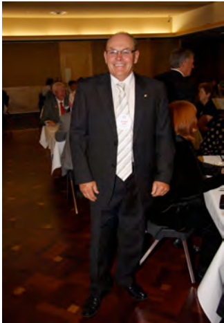
I'm lookin' smart and tucked my shirt in Sir!

This is always a wonderful occasion as we celebrate the young people of the region who are heading off to University or to some other exciting tertiary event. It is one of those times when we get dressed up and have some "class" about the evening. It was great to see everyone so well turned out...with shirts tucked in and big smiles.