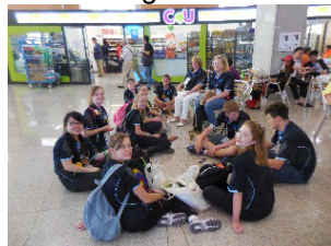
D9710 Interactors chilling