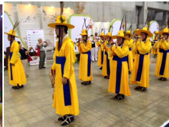
At the House of Friendship Opening