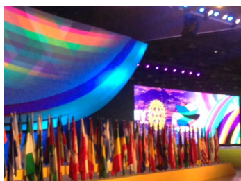
Flags of the Rotary World