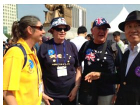
3K Walk for Peace