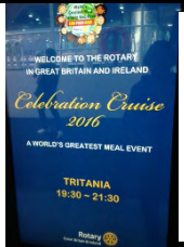
River cruise organised by RIBI "Worlds Greatest Meal to Help End Polio"