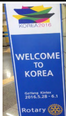
Welcome sign at railway station