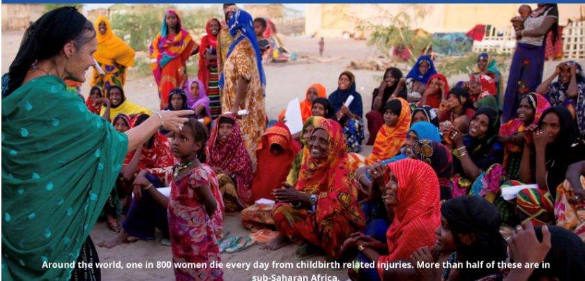
Around the world, one in 800 women die every day from childbirth related injuries. More than half of these are in sub-Saharan Africa.

To Keep collecting plastic bottle tops, as soon as we have a good collection we will send them to Canberra